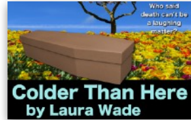
Our next production