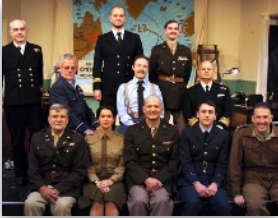
NODA Crit of Pressure