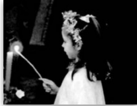
My first stage experiences