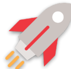
2019/20 season launch event