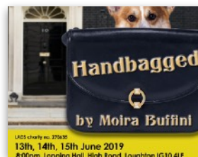
Our Next Production