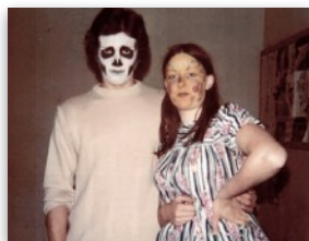
My first stage appearance