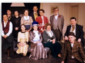
NODA Crit of Pygmalion